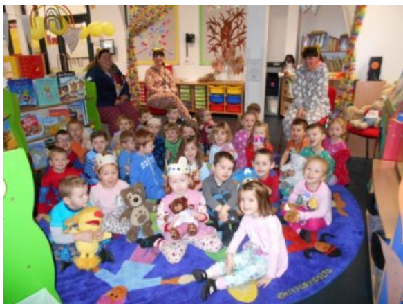
Fundraising for Children in Need