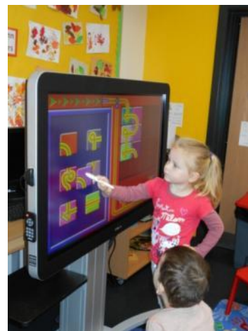
Using technology to problem solve