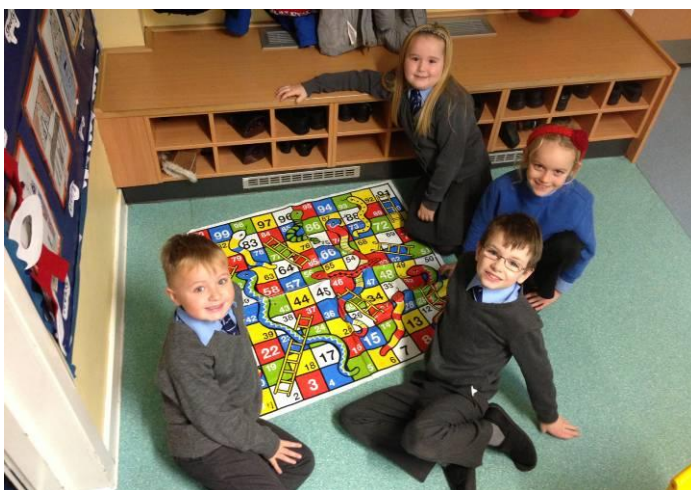
Numeracy skills in action!