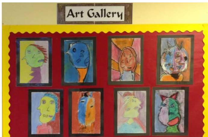
An exhibition of our art and design skills.