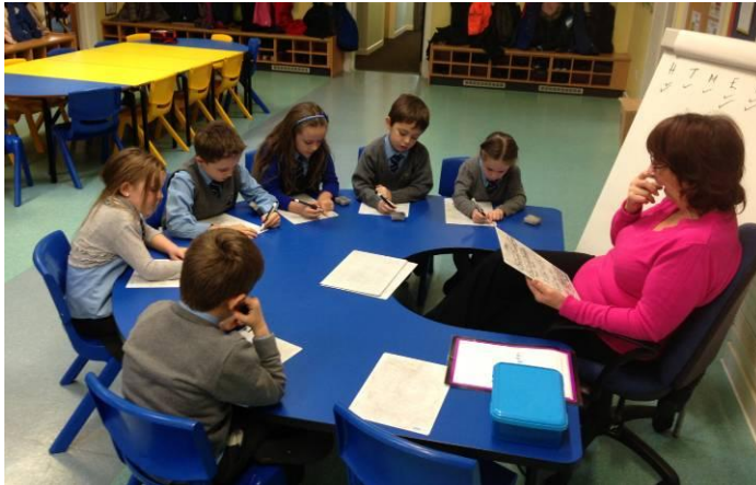
Our children demonstrating their Active Literacy skills.