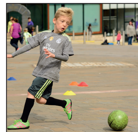
ON THE BALL: One youngster shows his skills during the celebrations

Local sports clubs delivered free sessions in basketball, athletics, hockey, gymnastics,