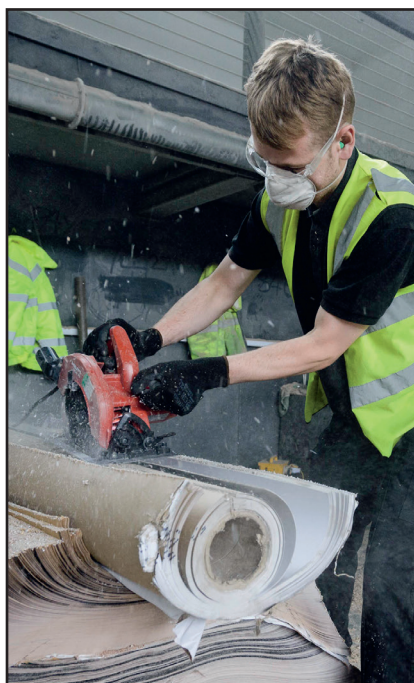
RELIABLE: Highlander International are the largest independent paper recycler in the country

"The grant support is in many ways the tip of the iceberg with the professional advice, support and encouragement the team provides aimed at getting the best for the business, the best for the local economy and the best for the community."