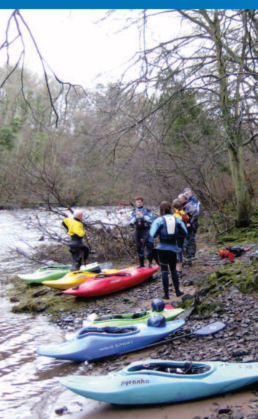
Water access, River Clyde - Smugglers' Bridge Hazelbank (Stuart Clark)