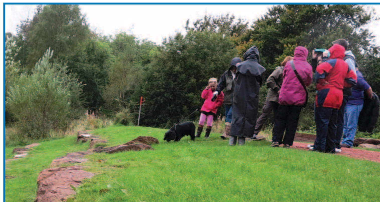
Community projects - Redlees Park by Blantyre (Community Links - South Lanarkshire)