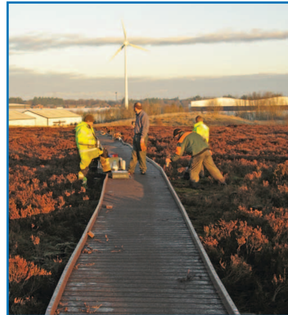
Replacing boardwalk - Langlands Moss Local Nature Reserve, East Kilbride