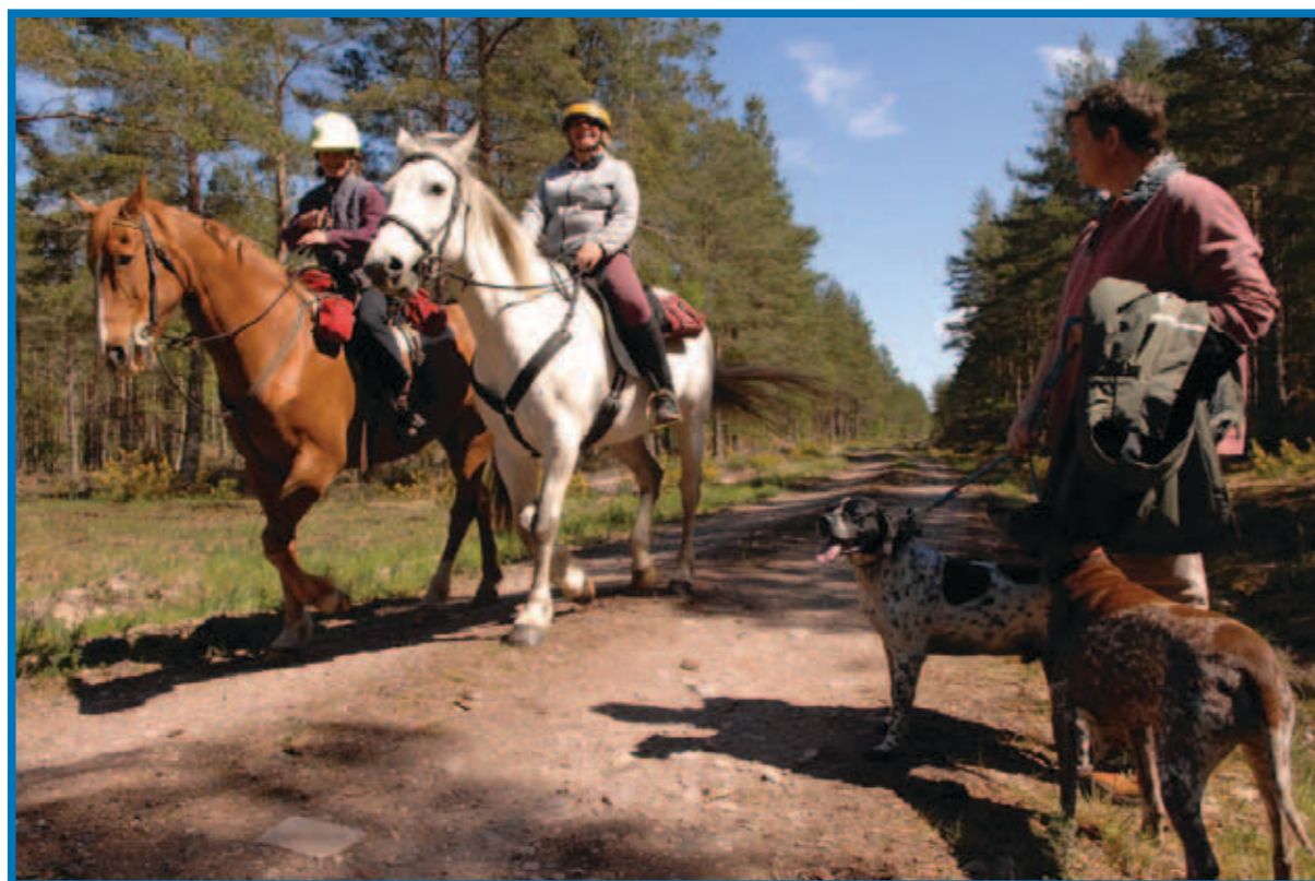
Forest routes, Clydesdale