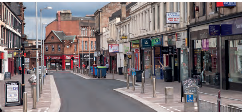
Table 4.2 Strategic and Town Centres

4.11 The individual centres in South Lanarkshire support a diverse range and scale of economic and social roles and functions. These include shops, offices, entertainment, civic, education, health and leisure activities. Collectively, they make up a network of centres ranging from strategic and town centres to neighbourhood centres. These are listed in Tables 4.2 and 4.4.