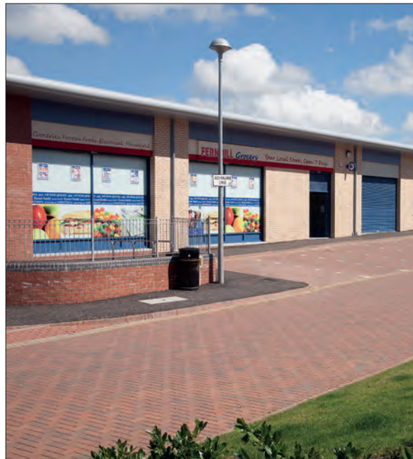
Table 4.4 Neighbourhood Centres

4.14 Within smaller towns, villages and neighbourhoods there is typically a small group of shops including grocers, newsagents, chemists, bakers and other services which serve the local community. These centres may also have hot food shops, betting offices and hairdressers. These provide a day-to-day service and are particularly important to less mobile people in communities. It is important to preserve the retail function of these centres. In particular, the Council would be concerned if convenience (food) shopping were to disappear from these smaller centres. Table 4.4 lists the neighbourhood centres.