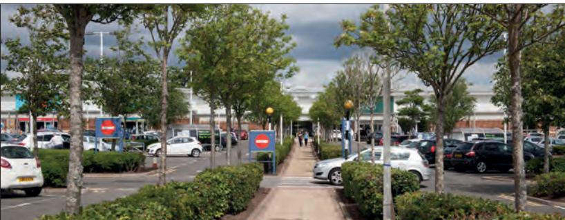
Table 4.5 Out-of-Centre Retail/Commercial Locations

4.16 In addition to the strategic, town and neighbourhood centres there has been demand for other retail and commercial floorspace outwith these centres. The location of out-of-centre retail and commercial developments, both operational and consented, are shown on the proposals map and listed in Table 4.5. In some cases the location is restricted to commercial uses only.