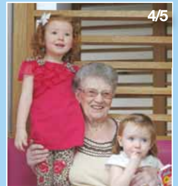
Sheltered housing facilities raise standards to new high