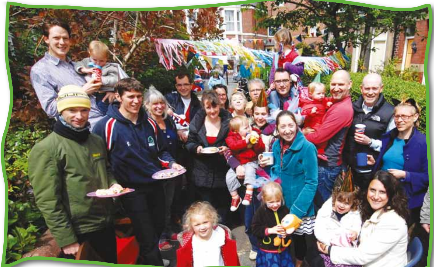
Big Lunches have been held all over the UK, bringing communities, generations and cultures together, making people feel better connected