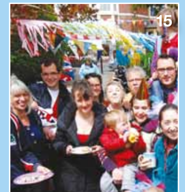
Bring your community together by taking part in the Big Lunch