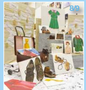
Schools join together for Holocaust Memorial Day