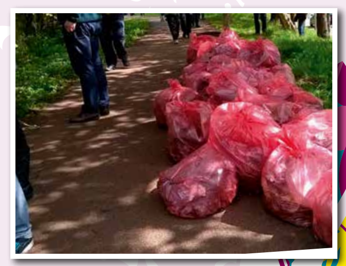
Community litter pick at Holmhills in June 2015

www.cambuslang communitycouncil.com/ friends-of-holmhills-park or email CAG@southlanarkshire.gov.uk