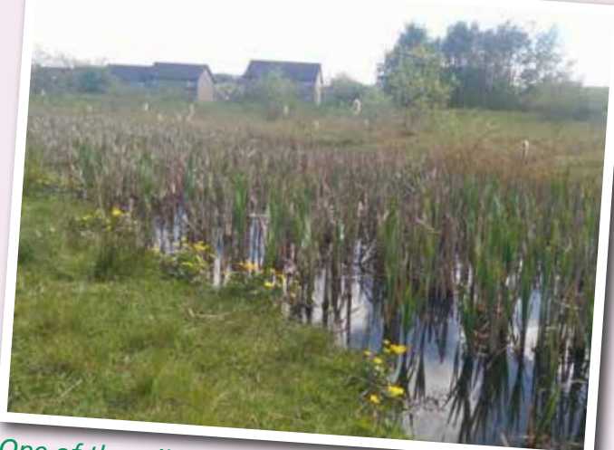
One of the wildlife ponds at Holmhills

Project 31 has been visiting Holmhills to run events and activities for local families. The Countryside Ranger Service has been working with them to help with a litter pick, minibeast hunt and pond dipping event. Project 31 provide a wide variety of fantastic, free of charge activities and services to children, young people, parents and families in Rutherglen, Cambuslang and wider South Lanarkshire. Come along and