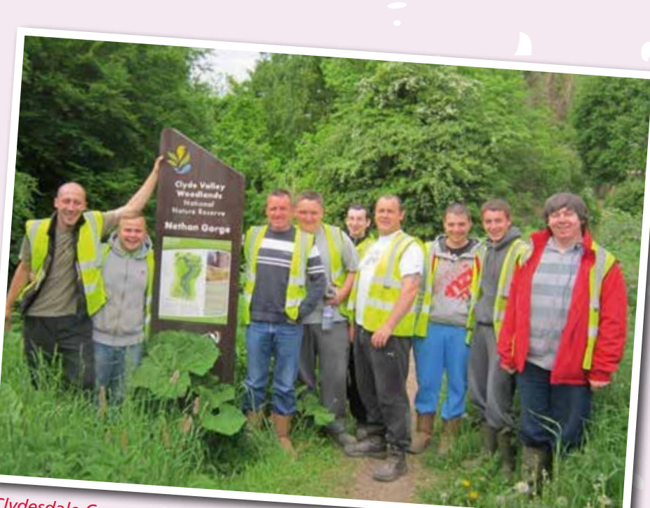
Clydesdale Community Initiatives volunteers carrying out environmental work at Nethan Gorge Woodlands

For up to date listings, go to www.clydeandavonvalley.com/events