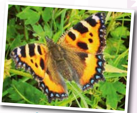
Small tortoiseshell butterfly

of groups to help improve sites and engage with local communities. This year we have moved away from running as many formal courses and are focussing on providing volunteers in South Lanarkshire with informal events, courses and networking opportunities. For example, we have worked with OPAL (the Open Air Laboratory <u>www.opalexplorenature.org</u>) to show the group at Holmhills Community Park how to use the water quality survey pack, and those at Millheugh & Greenhall to survey hedgerows using the biodiversity survey pack. Our Partners the Clyde and Avon Valley Landscape Partnership <u>www.clydeandavonvalley.org</u> also run training courses and events throughout the year – have a look at their article in this newsletter for details.