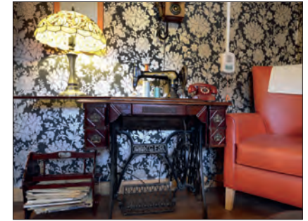
REVISITING PAST DAYS: The Living Room is a loving recreation of a room in a 1950s home.

everyone associated with Meldrum and we were overwhelmed with donations from staff, families and colleagues. We received so many items that our service users could relate to, including war medals, old newspapers, brass polishing kit, typewriters, and even an antique Singer sewing machine and a writing bureau.