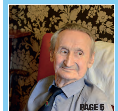
The Living Room is a loving recreation of a 1950s home