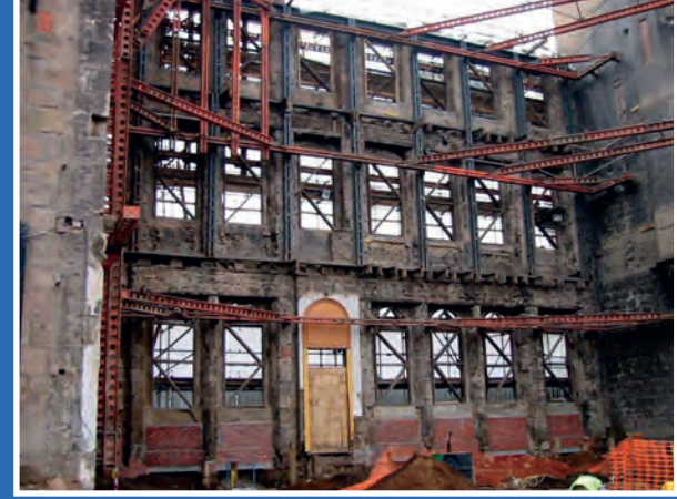
PAINSTAKING RESTORATION: The £12.5 million project in 2005 was a massive undertaking.