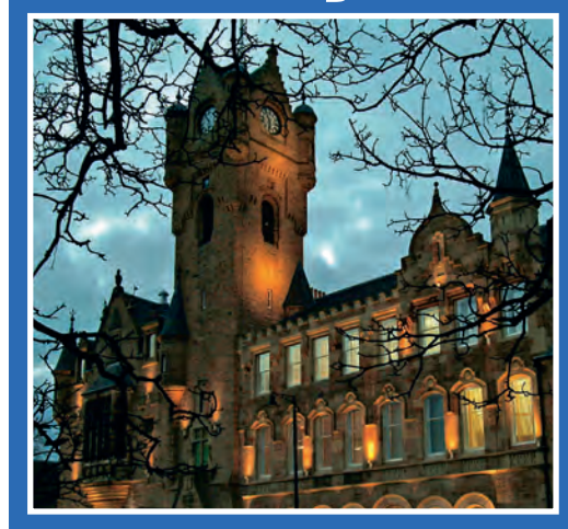
LOCAL LANDMARK: Rutherglen Town Hall restored to its former glory 10 years ago.