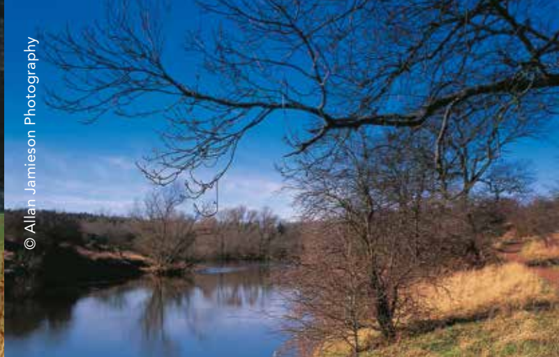
River Clyde, Baron's Haugh, Motherwell