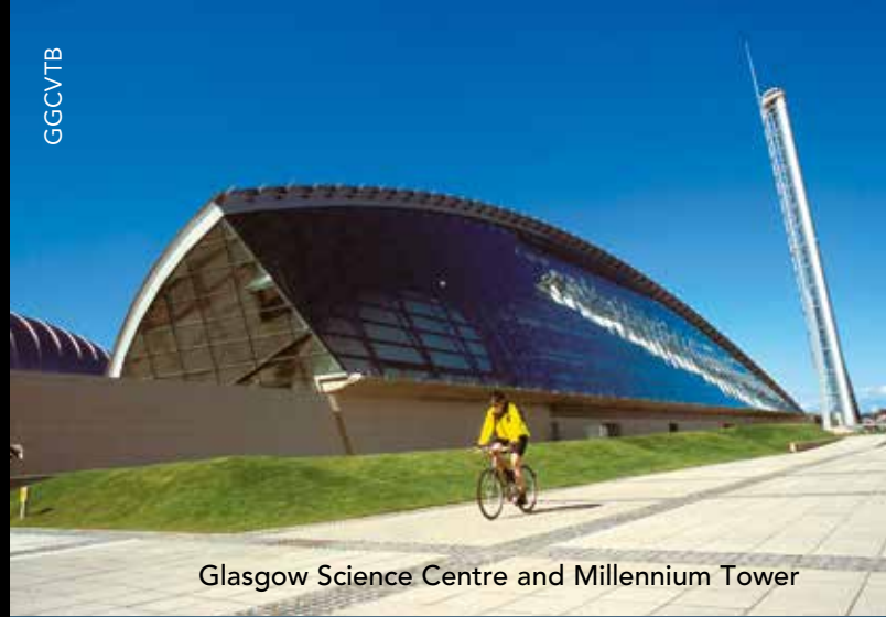
Glasgow Science Centre and Millennium Tower