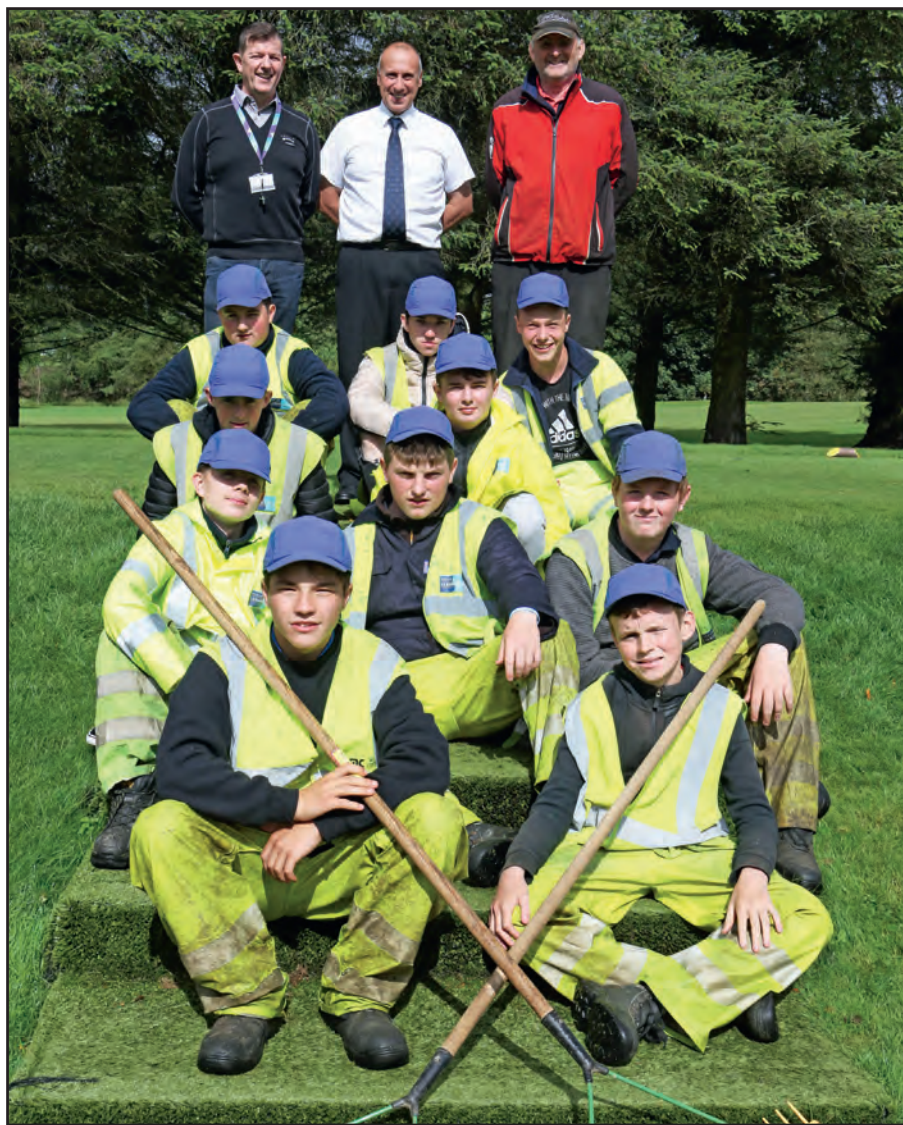
READY: The trainees are learning valuable skills on the course

"When people come up to you and say the golf course has never looked better you are doing a great job it gives you a real confidence boost"