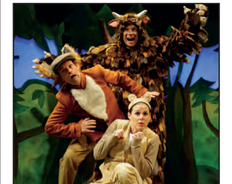
SCARY: Youngsters will love the live action version of the Gruffallo

The most fearsome creature that never was - but is - takes to the stage in this enchanting production combining songs, laughter and