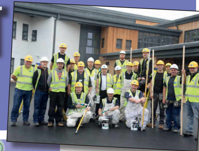
DELIVERED: Some of the team responsible for building the new school