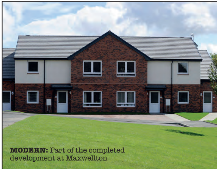
MODERN: Part of the completed development at Maxwellton

The Carluke development is part of the council’s plans for a