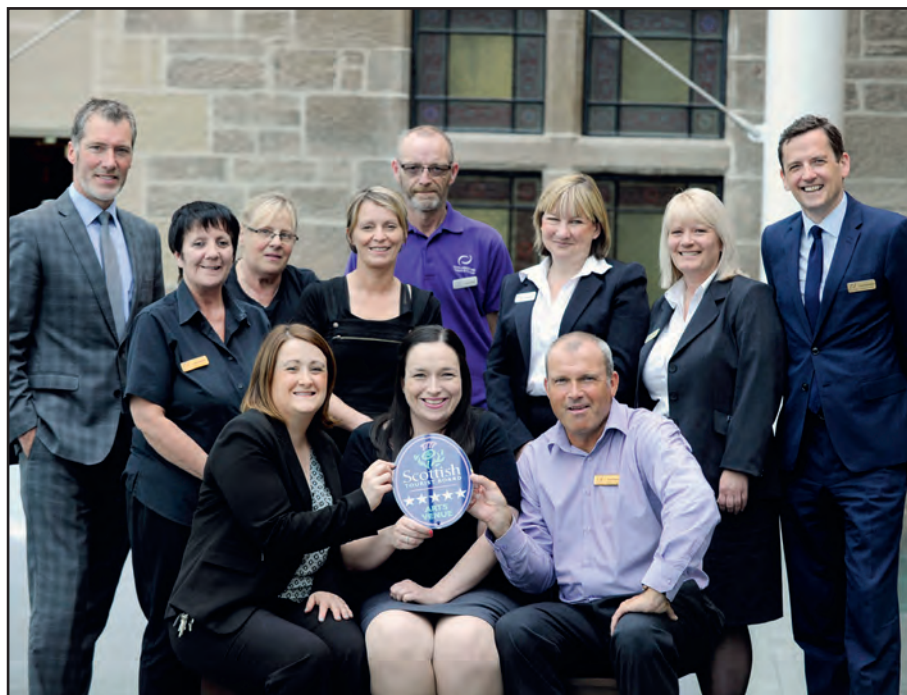
DELIGHTED: The team at Rutherglen Town Hall proudly show off the award which gives them five-star status

The Visitor Attraction scheme was previously run by the Association of Scottish Visitor Attractions and was