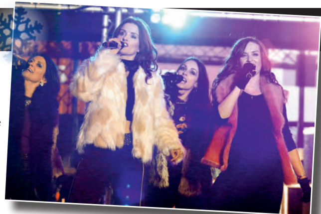
CHRISTMAS CHEER: Irish favourites B*Witched led the celebrations at the Hamilton switch on events

"There were loads of things to do and I'm sure the entertainment was enjoyed by everyone."