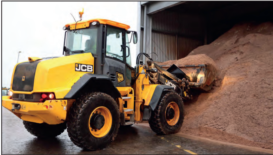
SUPPLIES: The council has more than 35,000 tonnes of grit ready for the cold weather