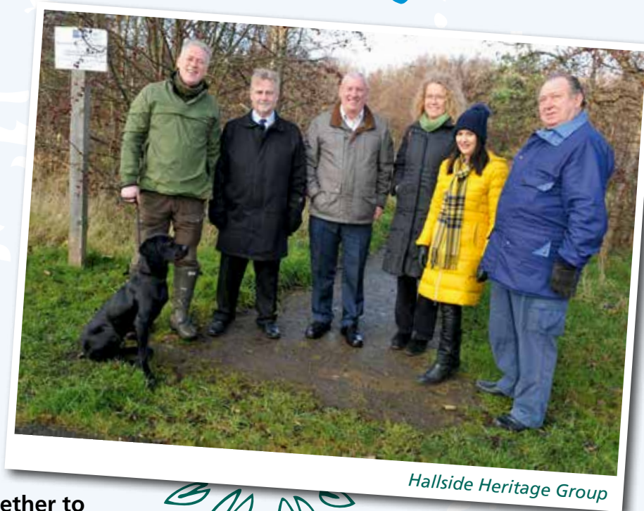
Hallside Heritage Group

A community team has come together to transform the site of the former Hallside Steelworks beside Newton railway station into use as a community greenspace.