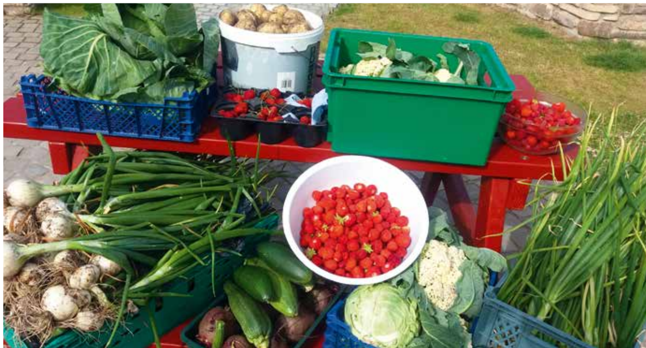
Donated Fruit and Veg