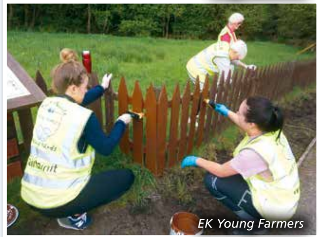
EK Young Farmers