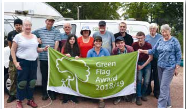
Green Flag Award!

Castlebank Park recently retained its Green Flag Award status, making it 1 of 71 Green Flag Parks in Scotland. Lanark in Bloom are also hoping to take home Gold at this year's Beautiful Scotland awards!