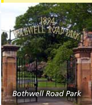
Bothwell Road Park