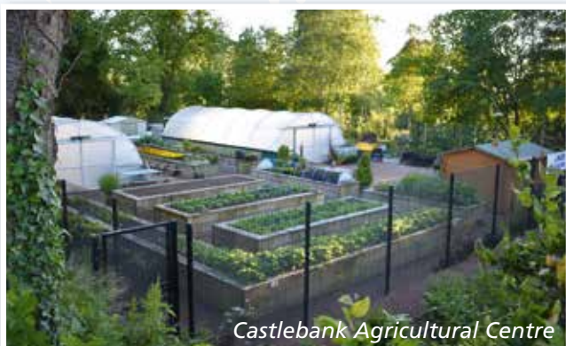
Castlebank Agricultural Centre

Castlebank Horticultural Centre is located within historic Castlebank Park at the bottom of Lanark.