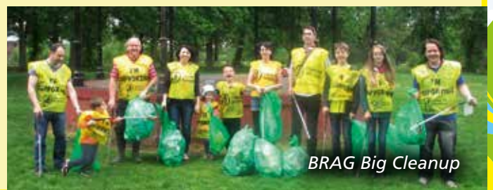
BRAG Big Cleanup