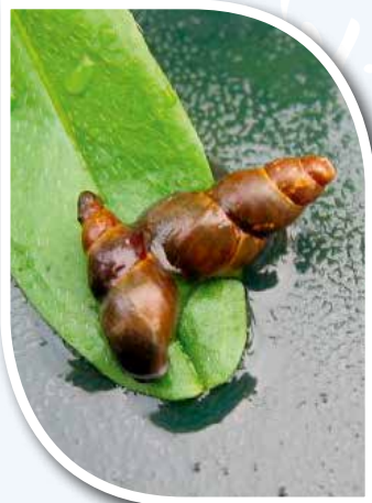
↑ Mud snail ( Omphiscola glabra)

Our Marvellous Mud Snails project is working to conserve the rare Pond mud snail ( Omphiscola glabra ). This freshwater snail has a UK distribution but is only currently known from seven sites in Scotland, two of these sites are within neighbouring council areas of North Lanarkshire and West Lothian. A key component of the project is a captive breeding programme where volunteers and schools are taking care of small populations of Pond mud snails. Any offspring that are born will be released into new sites throughout the snails current range. We will be running a freshwater snail identification workshop during autumn with the hope that attendees will feel confident to go out and record freshwater snails in their area.