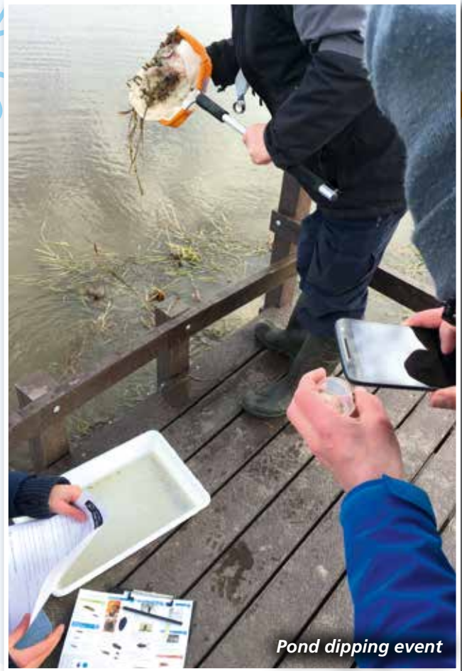
Pond dipping event

With the survey period coming to an end we are now busy writing up reports and developing projects. However, we are still running workshops throughout the autumn. As the weather starts turning cold we start focusing on freshwater habitats and we currently have two projects people can get involved with, our Heritage Lottery Funded Marvellous Mud Snails project and our Scottish Natural Heritage funded Fantastic Freshwaters.