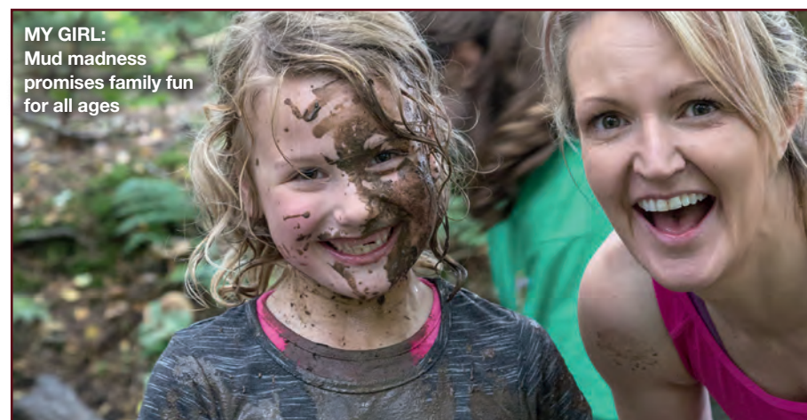
MY GIRL: Mud madness promises family fun for all ages

Race day registration is open from 8:30 to 9:30am in the courtyard at Chatelherault Visitor Centre. For further information visit the Mud Madness page on the SLLC website: bit.ly/2LVCC2N . Mud Madness will take place on Sunday, 7 October.