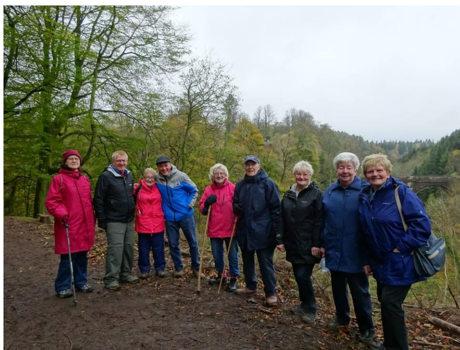
Health Walk at Chatelherault Country Park