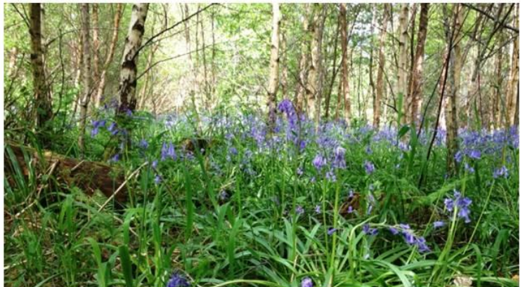
Photos: salmon (Malcolm Muir); volunteers controlling Himalayan balsam (CSGNT); conifer extraction at Chatelherault Country Park (Malcolm Muir); regenerating native woodland (Susan McNeish).