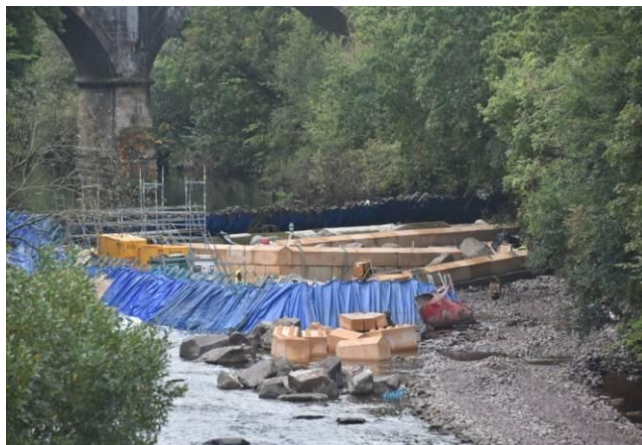
Ferniegair fish pass in construction

From August to October 2017, 3ha of conifer plantation was removed from the site as part of Forestry Commission’s WIAT programme. Paths were improved and river edges strengthened. This area will now convert to native woodland with associated ground flora that will greatly improve the biodiversity value of the site and contribute to local habitat connectivity of woodland and river corridor.