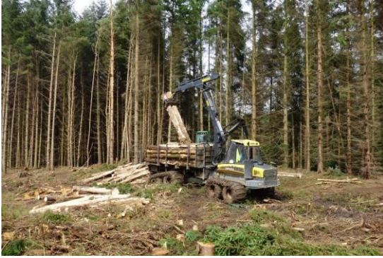
Conifer extraction at Chatelherault

6.5 Plantations on Ancient Woodland Sites (PAWS) restoration: Under a regeneration programme for the ancient gorge woodlands on the Avon Water, 20 hectares of conifer plantation have been removed from Chatelherault Country Park (part of the Clyde Valley Woodlands NNR) during 2016 and 2017 to allow native woodland to regenerate. This is addition to 16 hectares (ha) that were cleared of conifers in 2005 and have regenerated very successfully. In 2017, a further 3ha of conifers were removed from the Rotten Calder valley at Blantyre under a community led regeneration programme with the Friends of the Calder.