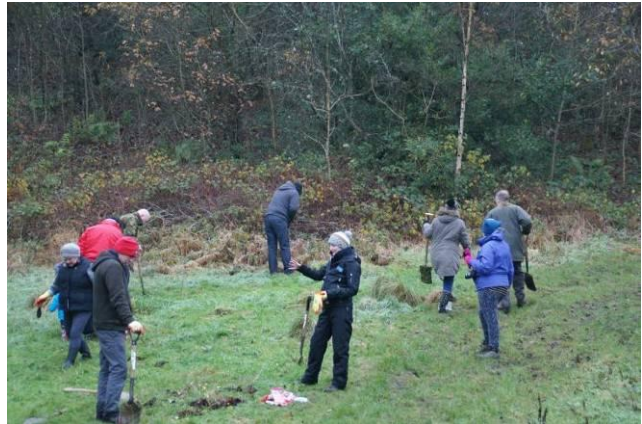
Tree planting event

6.1 Friends of the Calder: The Council has been working with this community group at Millheugh/Greenhall/Barnhill in High Blantyre since 2015. The Countryside Ranger Service has helped with around six events per year such as pond dipping, bat watching and OPAL surveying, with the aim to involve the community with Citizen Science activities.