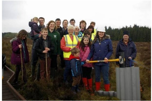
The Bog Squad launch at Langlands Moss

The Council has worked in partnership with FOLM to manage this lowland raised bog for over ten years, and have been awarded over £100,000 in funding. The Bog Squad team worked with the Friends from 2014 to 2016 to help restore the site. This volunteer task force was created by Butterfly Conservation Scotland to carry out rehabilitation works on peat bogs across central Scotland, with funding from SNH's PeatlandACTION project.