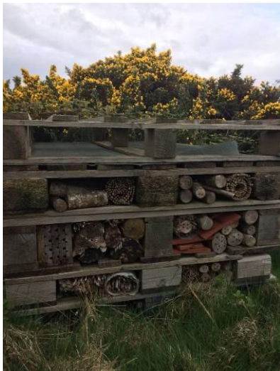
Example of an insect hotel

In 2017, SNH's PeatlandACTION programme granted funding for a feasibility study to assess the bog and surrounding land. This will help inform the direction of future management which will aim to continue to restore the natural hydrology of the bog by installing more dams and creating a lagg zone in place of the existing adjacent conifer plantation.