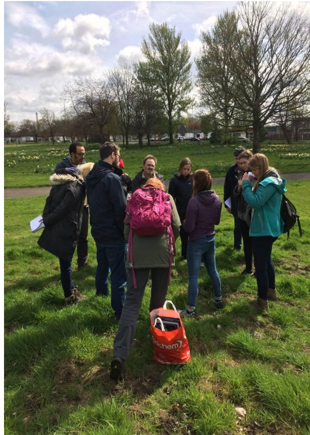
Water vole identification and survey training