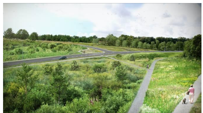
The vision of the new road