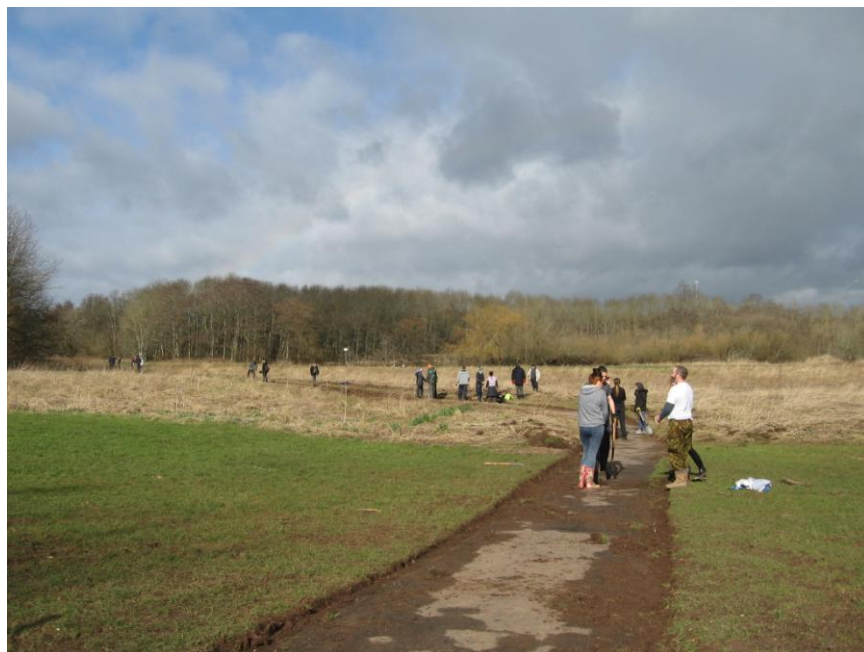
Volunteers clearing the path at South Haugh