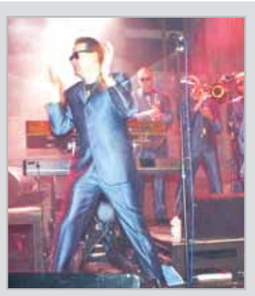
Catch Big Vern and the Shootas

It will provide seven classrooms, gym hall, dining room, stage, staff facilities, library and IT suite, 21-space car park and multi-use games pitch.