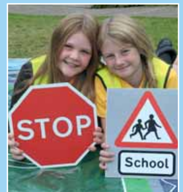
Training Junior Road Safety Officers