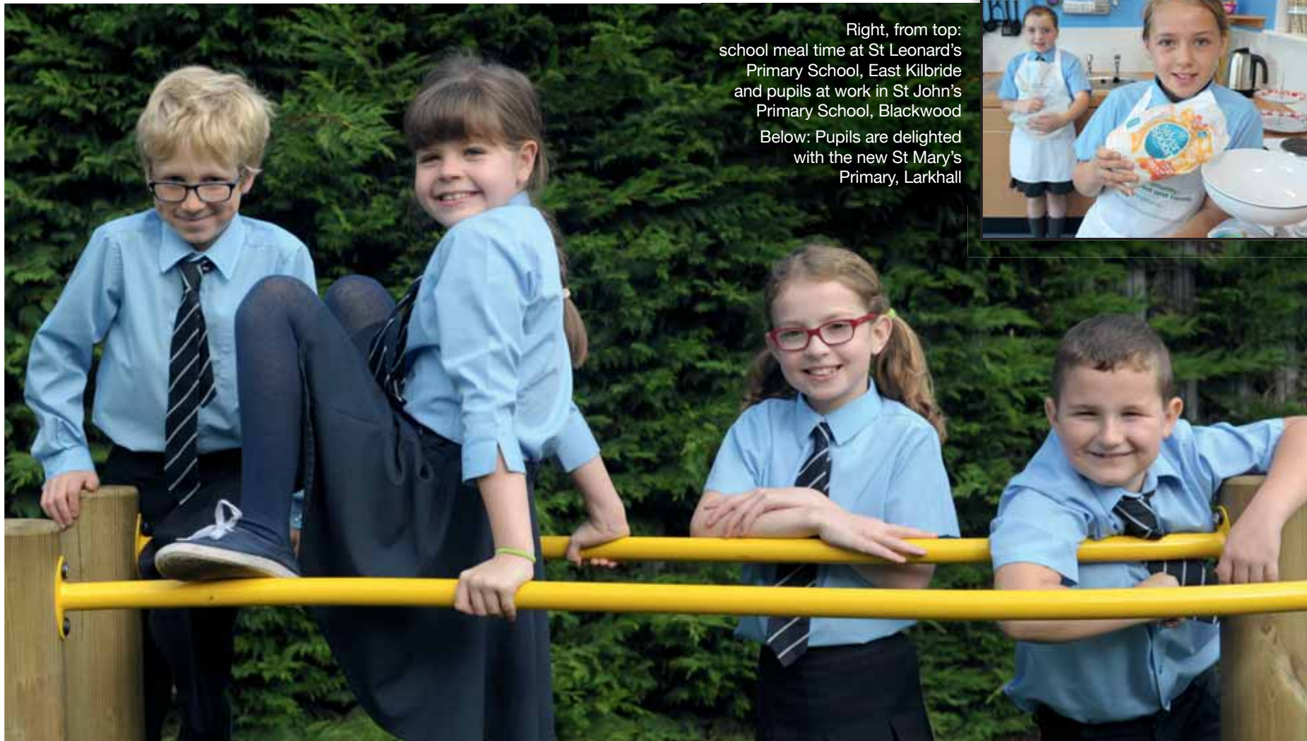
Right, from top: school meal time at St Leonard's Primary School, East Kilbride and pupils at work in St John's Primary School, Blackwood Below: Pupils are delighted with the new St Mary's Primary, Larkhall