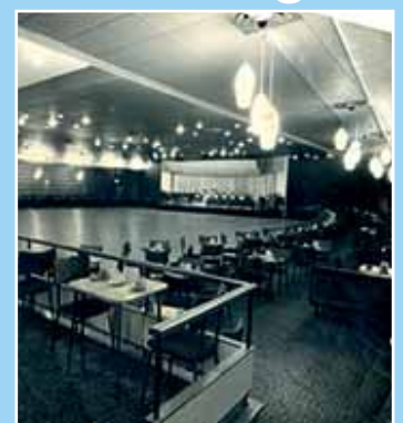
Stars graced Olympia Ballroom