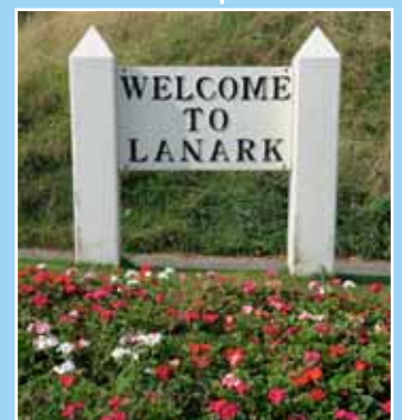
Growing success for colourful communities