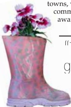
Top: Gorgeous blooms in Uddingston helped win the Urban Community Trophy Below: Groups from right across South Lanarkshire were recognised for helping to keep their communities beautiful

"The people who look after all our green spaces do a tremendous job"